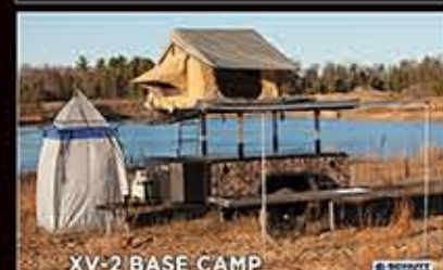
XV-2 BASE CAMP

ALL ALUMINUM WELDLESS CONSTRUCTION The entire frame and bed are made from 100% aluminum and constructed using the patented Alcoa Huck Bolt system. This results in superior strength and resistance to vibration fatigue than with traditional welded assemblies.