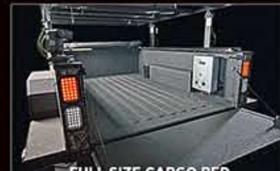
FULL SIZE CARGO BED