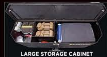
LARGE STORAGE CABINET