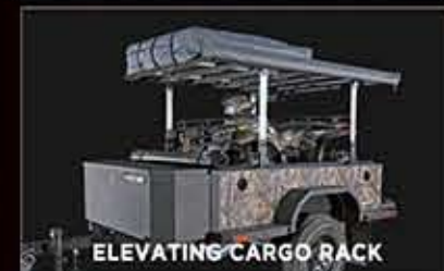
ELEVATING CARGO RACK